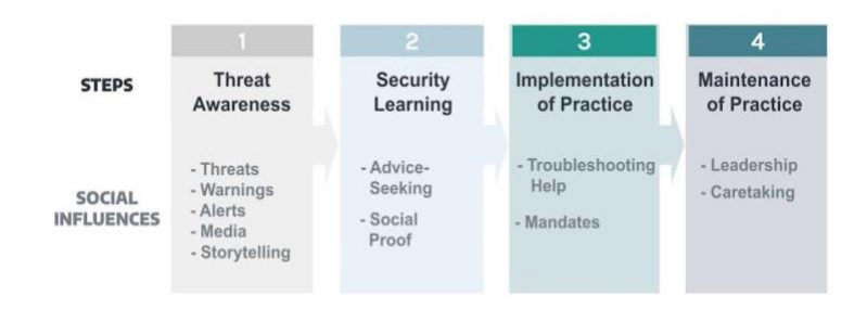
Figure 1: Diagram of the four steps that were common to people's security narratives (N=17) and the social influences that were commonly most influential at each step.

Towards this goal, I have conducted remote interviews with N=17 U.S. residents aged 18 or older. I find that their adoption of security practices can be broken down into four stages: Threat Awareness (Step 1), Security Learning (Step 2), Implementation of Practice (Step 3), and Maintenance of Practice (Step 4). Social influences are important to move people to each stage, such as Troubleshooting that helps people to